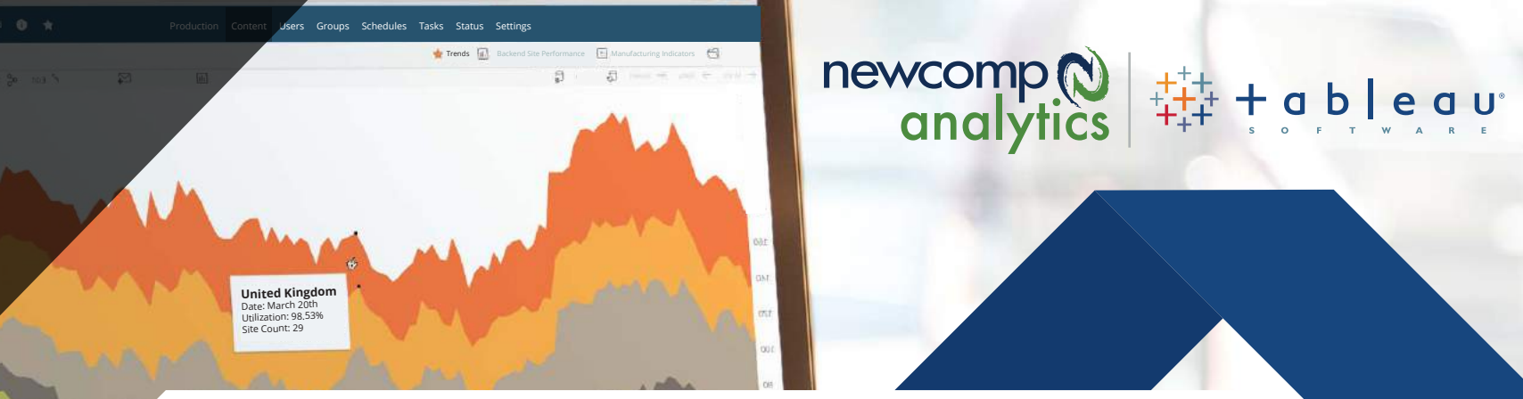
TABLEAU COURSES AVAILABLE